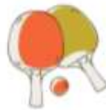
Table Tennis Hall.