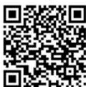
Free events in Moscow