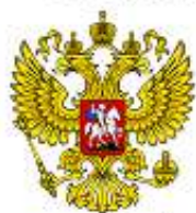
Coat of Arms of the Russian Federation