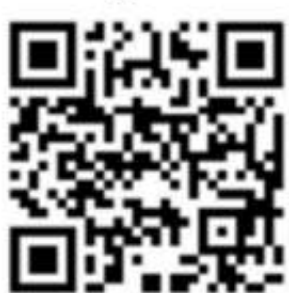
Occasions in Moscow